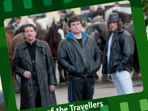
King of the Travellers

The Broadcasting Authority of Ireland is pleased to support the International Association for Media and Communication Research (IAMCR) 2013 Conference