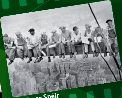
Lón sa Spéir